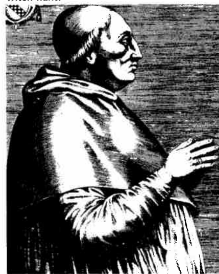
Pope Innocent VIII who ordered German ecclesiastical and secular authorities to co-operate with Heinrich Institoris in his witch-hunt.

Although these ecclesiastical territories were the most ferocious exterminators of witches, secular territories were not always far behind them in their zeal to purge the commonwealth. The tiny county of Helfenstein killed sixty-three witches in 1562-63. The Duchy of Braunschweig-Wolfenbüttel executed fifty-three between 1590 and 1620, while Duke