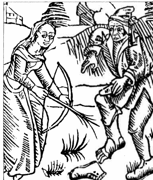
A fifteenth-century depiction of maleficium: a witch lames a peasant.

August of Braunschweig-Lüneberg eliminated seventy between 1610 and 1615 in the tiny district of Hitzacker. The County of Lippe tried 221 witches between 1550 and 1686 and another 209 in the town of Lemgo. All told the Duchy of Bavaria probably executed close to 2,000 witches, and the secular territories of south-western Germany very likely accounted for another 1,000. Even the imperial cities hunted witches in sizeable numbers, both among their own burghers and among the peasants of their outlying hinterlands.