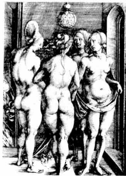
(Left) The Bewitched Stableboy ; engraving of 1544 by Hans Baldung Grien. (Above) Four Witches by Albrecht Dürer.

the advance of two notions, both fateful for the development of the German panic trial; gradually, the witches' sabbath became a common obsession among the ruling élite; and, just as gradually, territorial laws were altered to allow for the execution of witches whose only crime was association with the devil, regardless of harm ( maleficium ) to anyone. In 1572 the Criminal Constitutions of Electoral Saxony declared, for example, that 'if anyone, forgetting his Christian faith, sets up a pact with the devil or has anything to do with him, regardless of whether he has harmed anyone by magic, he should be condemned to death by fire'. With a law such as this, one could proceed to torture a suspect until one had not only