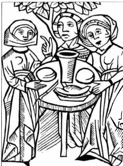
An early conception of the Sabbat, dating from 1489.

to harm a neighbour or secure his affection with love magic. Throughout the centuries of the witch-hunt these locally inspired and locally controlled sorcery trials continued to be common. They usually ended as abruptly as they had begun, with the execution or banishment of one or two witches. There was nothing peculiarly German in this procedure and nothing to cause the panic that the great witch-hunt inspired. But the true panic did not remain rooted in these rural concerns and did not rest content with the extermination of one or two geriatric outcasts.